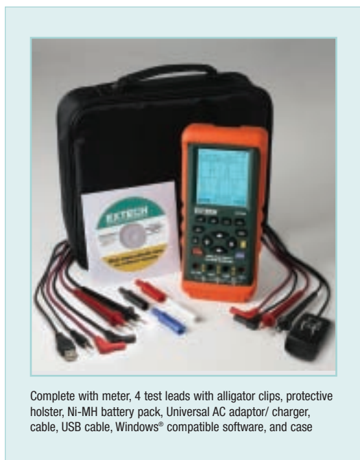
Complete with meter, 4 test leads with alligator clips, protective holster, Ni-MH battery pack, Universal AC adaptor/ charger, cable, USB cable, Windows ® compatible software, and case