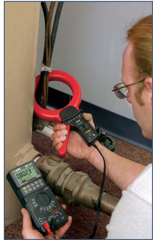
Model 2620 checking for ground fault currents