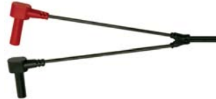
Model 2620 includes double reinforced 5 ft (1.5m) leads with 4mm safety banana plugs