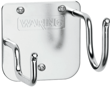
WSB01 Wall Hanger for Immersion Blenders