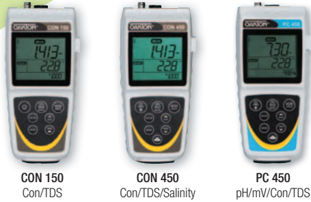
CON 150 Con/TDS CON 450 Con/TDS/Salinity PC 450 pH/mV/Con/TDS