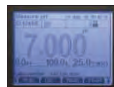
Unstable reading is faded