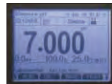
Reading turns solid when stable.