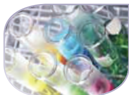
Research and Development