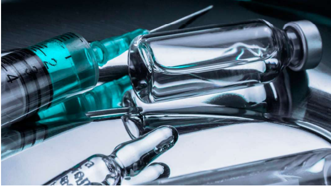
Vaccine & Pharmaceuticals