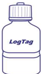
Glycol Buffer Not Included