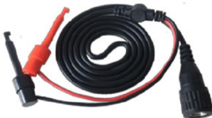
BNC to test hook connector