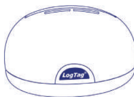
LTI-HID Not Included