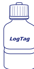
Buffer assembly Not Included (Silica sand recommended for temperatures below -40°C)