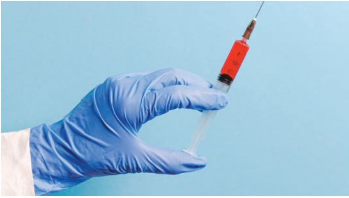
Vaccine & Pharmaceuticals