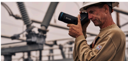
Assess the state of equipment from a safe distance, at any angle, or in any lighting condition