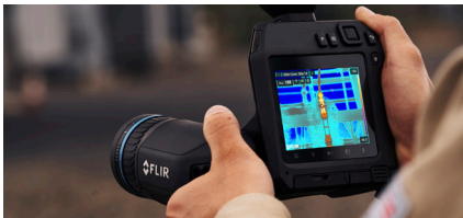
Collect and manage critical data quickly and easily