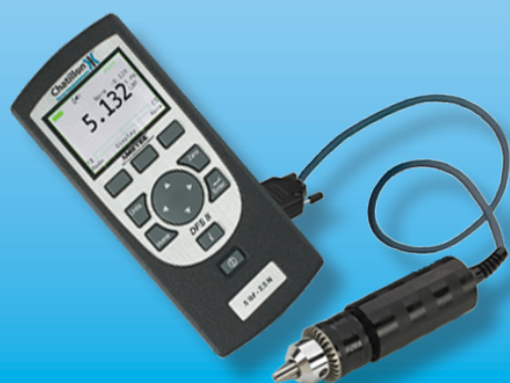
STS Sensor attached to the DFS II-R-ND gauge for torque measurement.