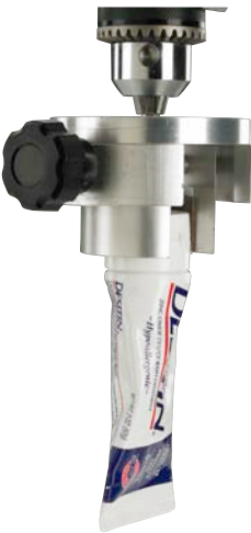
STS sensor attached to the B200308 torque fixture for measuring cap torque strength.