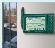
Wall mounted for storage and easy viewing of Temperature and Humidity trends with date/time stamp