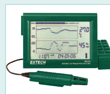
Desk mount configuration with easy to program swivel arm control panel plus probe with remote cable for reaching into ducts and humidity chambers