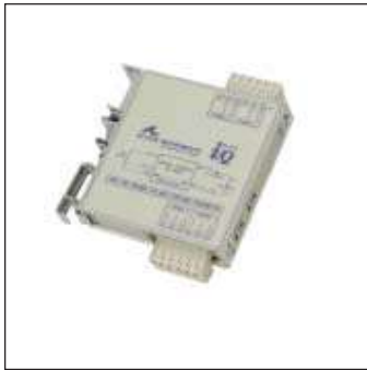
Q510-0xxx (2 Channel) Q510-4xxx (4 Channel)