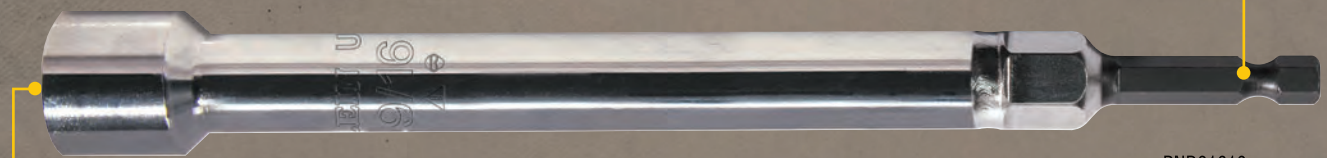
Available in a variety of hex sizes