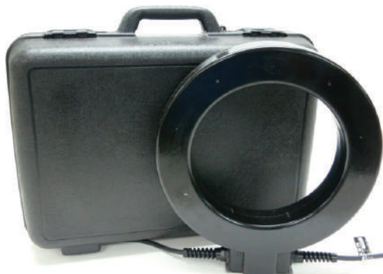
PL-10 with Case

For the correct and safe use of this equipment, proper training of operating personnel to required inspection techniques, specifications and safety requirements is necessary, and is the obligation of the user.