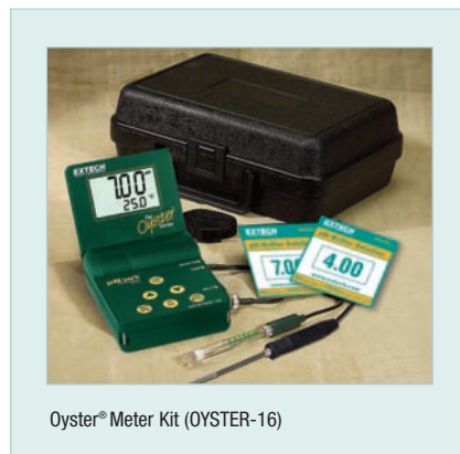
Oyster® Meter Kit (OYSTER-16)

OYSTER-15 .....Oyster™ Meter Kit OYSTER-16 .....Oyster™ Meter Kit with RTD Temperature Probe PH103 .....Tripak Buffers (6ea. of 4, 7, 10pH and 2 Rinsing solutions) 850185 .....RTD Stainless Steel Temperature Probe 60120B .....Mini pH Electrode (10 x 120mm) 601500 .....Standard pH Electrode (12 x 160mm) 601100 .....Flat Surface Electrode (15 x 106mm) 67500B .....Standard ORP Electrode (12x160mm)