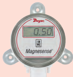
Standard MS with optional LCD