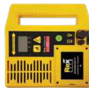
Rex LITE Transmitter: 1.9 lbs (0.9 kg)