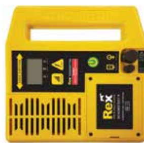
Rex Transmitter: 3.5 lbs (1.6 kg)

All other features, specifications, and components as per MPC-Rex