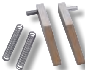
Shown: ML4242 Jaw Replacement Kit