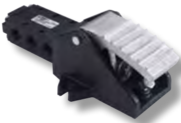
Shown: ML1797 Foot Pedal Controller. Supplied standard with ML3353.