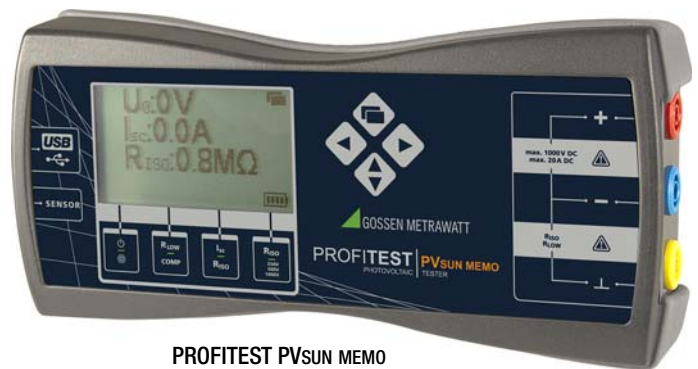
PROFITEST PVSUN MEMO