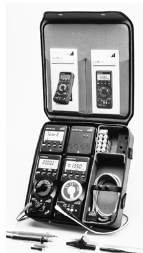
F840 (with sample contents)