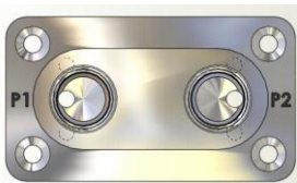
Standard DN & DI manifold