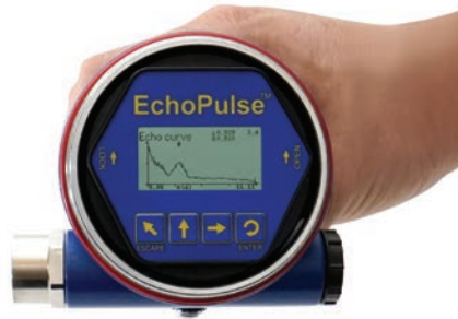
Echo Signal Return Curve Shown