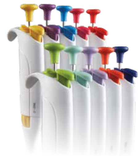
Each unit is brightly color coded and labeled with volume range (both top and side for quick visual confirmation)

Finally, responsiveness and accuracy are the most important functions during operation. The plunger assembly was designed from the ground up to reduce user hand strain. Each Pearl™ pipette requires just 2/3rds the pressure of a standard pipette, reducing hand fatigue and the potential for repetitive strain injuries (RSI).