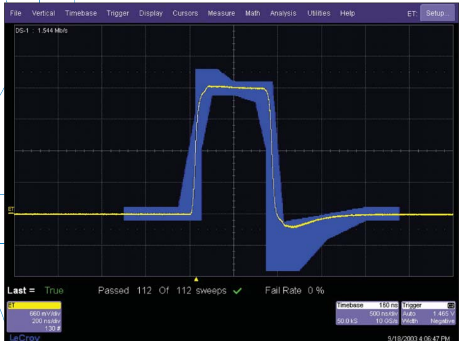
DS-1 Pulse Mask Test.