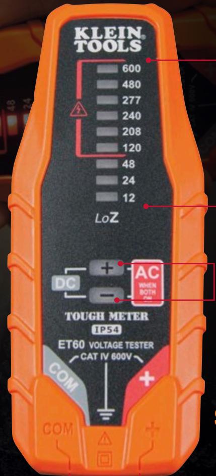
Voltage Indicator LEDs