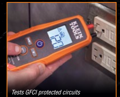
Tests GFCI protected circuits