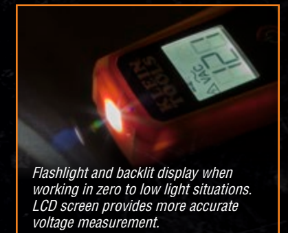
Flashlight and backlit display when working in zero to low light situations. LCD screen provides more accurate voltage measurement.