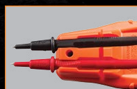
Test-leads seated in the lead holders on the back of the tester are spaced correctly to test tamper-resistant US-style outlets.