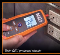
Tests GFCI protected circuits