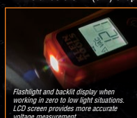
Flashlight and backlit display when working in zero to low light situations. LCD screen provides more accurate voltage measurement.