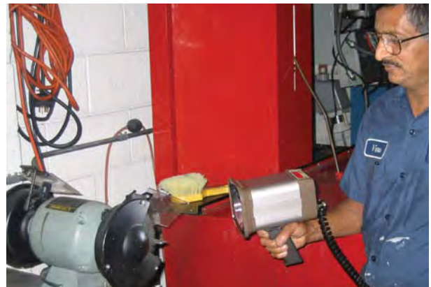
DT-315AEB Viewing Machinery