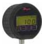
DPG-100 with Protective Rubber Boot