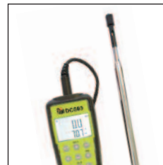
DC580C1 w/ hot-wire probe