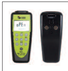
DC580 front and back