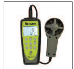
DC580C2 with vane probe