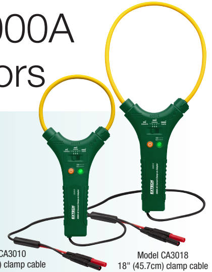
Model CA3010 10" (25.4cm) clamp cable

Expand your meter's capabilities to measure AC Current up to 3000A. Fit most MultiMeters or Clamp Meters with standard shrouded banana plug sockets. Flexible clamp jaw easily wraps around bus bars and cable bundles where standard clamp adaptors and meters can't. The thin 7.5mm cable diameter easily fits into tight spaces. Choose between a 10" (25.4cm) or 18" (45.7cm) clamp cable length.