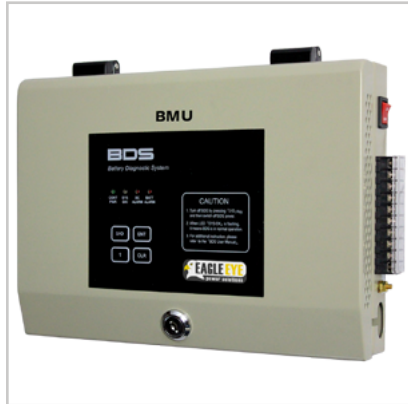
Main Processing Unit (MPU)

Common Applications: Power Utilities & Distribution, UPS Systems, Telecom