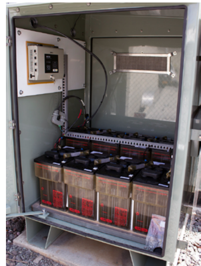
Installation to 48V Switchyard Battery

Reduce maintenance costs, improve up-time and manage your battery assets effectively by using the BDS-Pro battery monitoring solution for your system. Protect yourself from battery failure - one of the leading causes of facility downtime with battery monitoring.