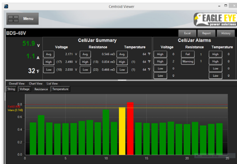
Centroid 2 Battery Management Software