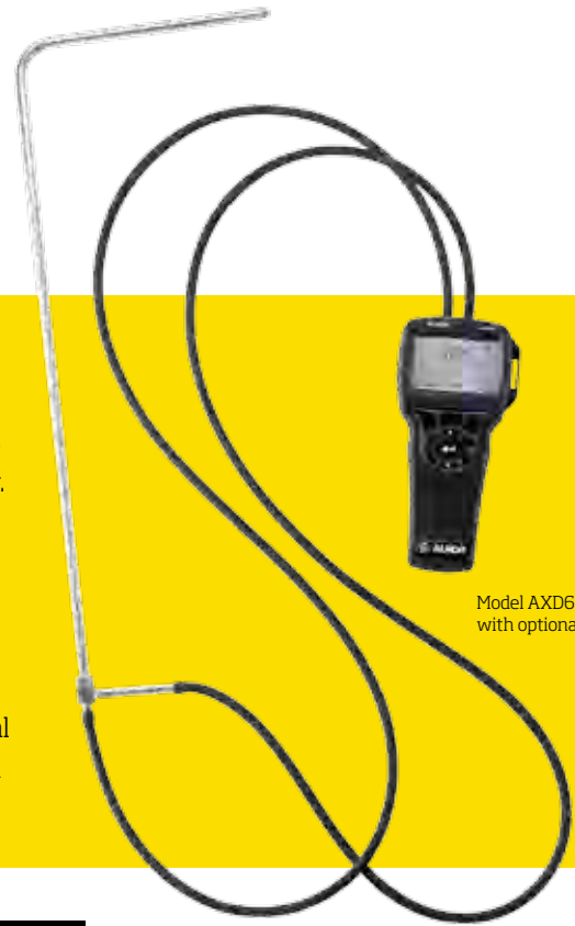
Model AXD620 shown with optional pitot probe

The AXD620 is a rugged, compact, comprehensive Micromanometer that measures pressure, and calculates velocity and volumetric flow rate. It can be used with Pitot tubes to measure velocity and then calculate flow rates with user-input duct size and shape. Premium features make it ideal for HVAC, environmental safeguards, commissioning, process control and system balancing.