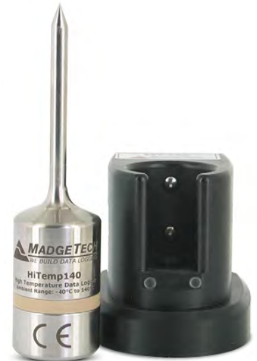
IFC400 (sold separately)

Using the MadgeTech Software, starting, stopping and downloading the HiTemp140 is simple and easy. To use, simply place the HiTemp140 in the IFC400 or IFC406 docking station (sold separately). Using the software, an immediate or delay start can be chosen, as well as the reading rate. Start the data logger, remove it from the docking station and the device is ready to be deployed. Graphical, tabular and summary data is provided for analysis and data can be viewed in °C, °F, K or °R. The data can also be automatically exported to Excel® for further calculations.