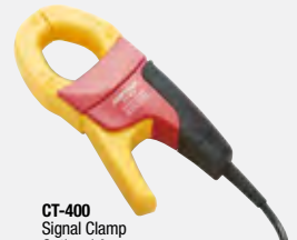
CT-400 Signal Clamp Optional Accessory