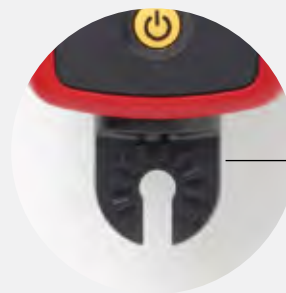
AT-8000-R universal attachment bracket for AT-410 Hot Stick attachment.