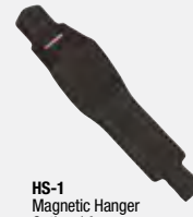
HS-1 Magnetic Hanger Optional Accessory