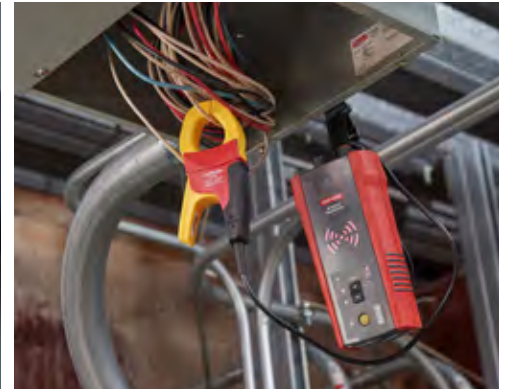
Intuitive transmitter automatically senses whether the system is energized or de-energized