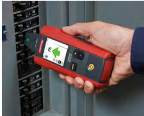
Reduce downtime with immediate and unambiguous breaker identification