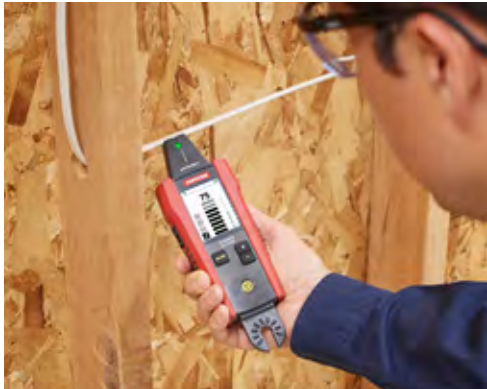
Most accurate wire tracing in its class with eight sensitivity modes