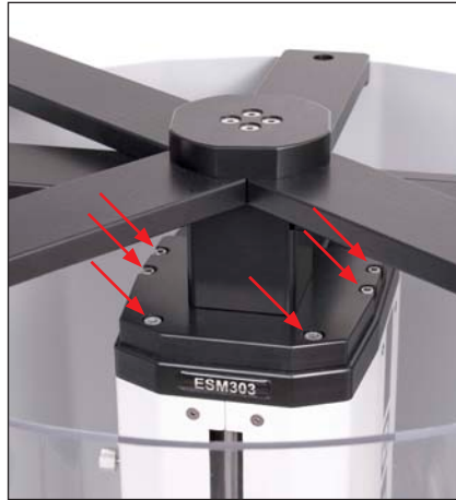
Fig. 1 Attaching the shield assembly to the top of the column