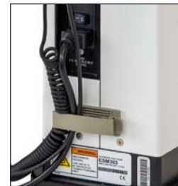
Fig. 4 Adhesive-backed guide is included for cable management