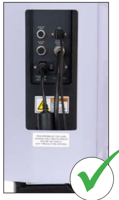
Fig. 3 Proper cable routing. Shown above: Models F105 / F305 / F505