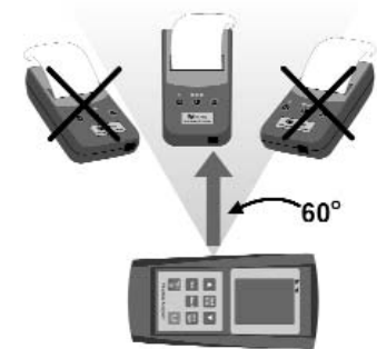
Horizontal Print Angle