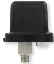
A1F with -PC weatherproof housing