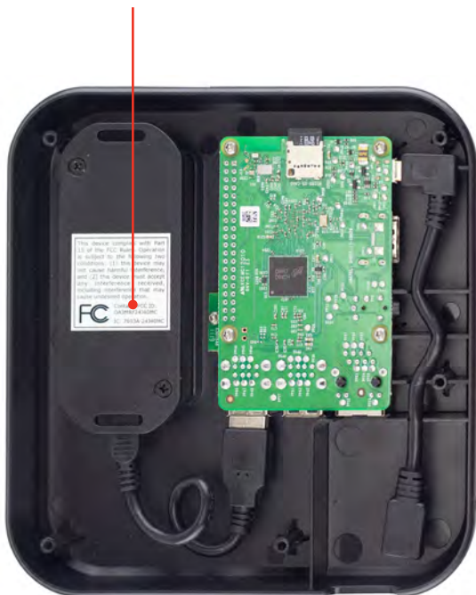
1a. Wireless Transceiver