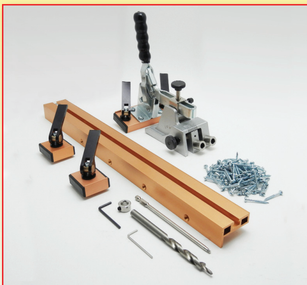
Professional Face Frame Jig System X1 - #8561