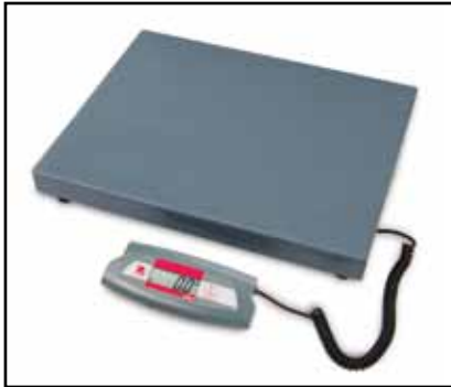
165lb and 440lb models available with large platform