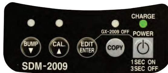
Control Panel View