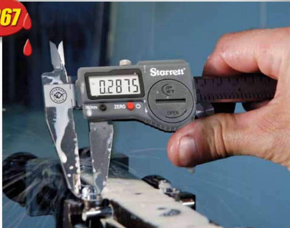
798 Electronic Slide Calipers have IP67 Protection against dust, dirt, water and coolant