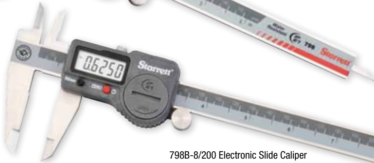
798B-8/200 Electronic Slide Caliper