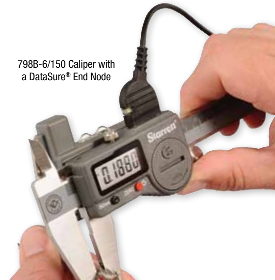
798B-6/150 Caliper with a DataSure® End Node

DataSure® Wireless systems provide exceptionally reliable data collection with transmission confirmation at the tool and single tool range to about 80 feet. Flexible and scalable, DataSure® systems can accommodate multiple tools and range to 3,000 feet.