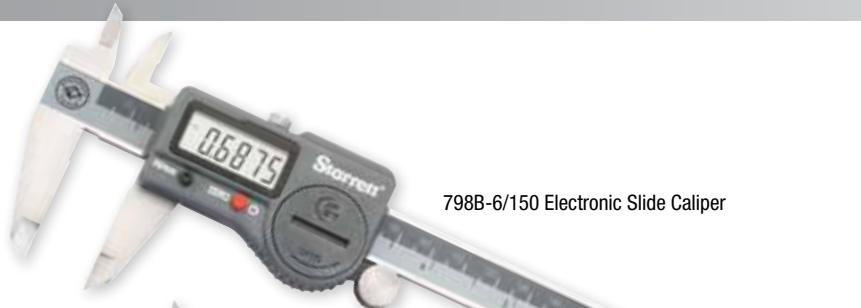
798B-6/150 Electronic Slide Caliper