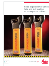
Leica Digisystem i-Series Safe and fast location of underground utilities