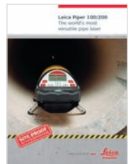
Leica Piper 100/200 The world's most versatile pipe laser