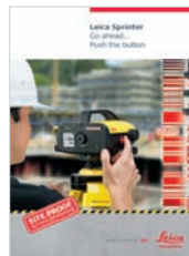
Leica Sprinter Quick, easy and efficient digital levelling

Illustrations, descriptions and technical data are not binding. All rights reserved. Printed in Switzerland – Copyright Leica Geosystems AG, Heerbrugg, Switzerland, 2012. 798541USen - 10.14 - galledia