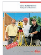
Leica Builder Not just for foremen