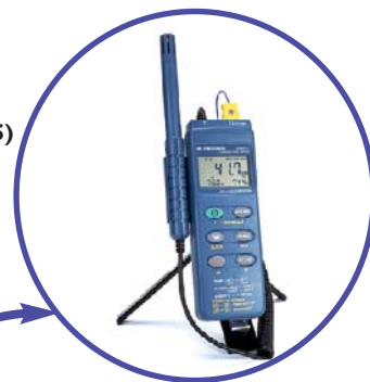
Tripod Mountable (tripod not included)