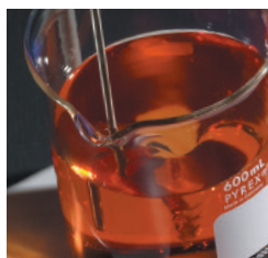
Temperature Probe for precision liquid temperature control in the liquid (as opposed to the plate top)