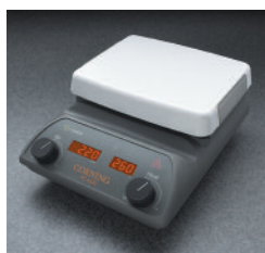
Model PC-420D shown

All models include Pyroceram® top and a two year warranty.