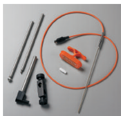
Hot Plate Accessories