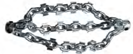
Carbide Tipped Chain Knockers