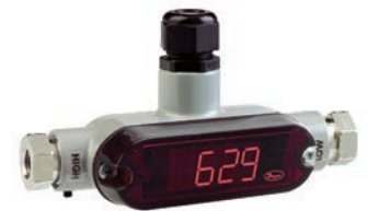
629 shown with optional Red LED and cable gland.