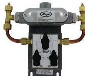
3-way valve assembly with integral bleed screws