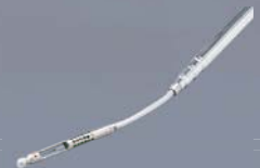
Telescopic, articulating probe