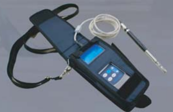
Hands-free Case now available!