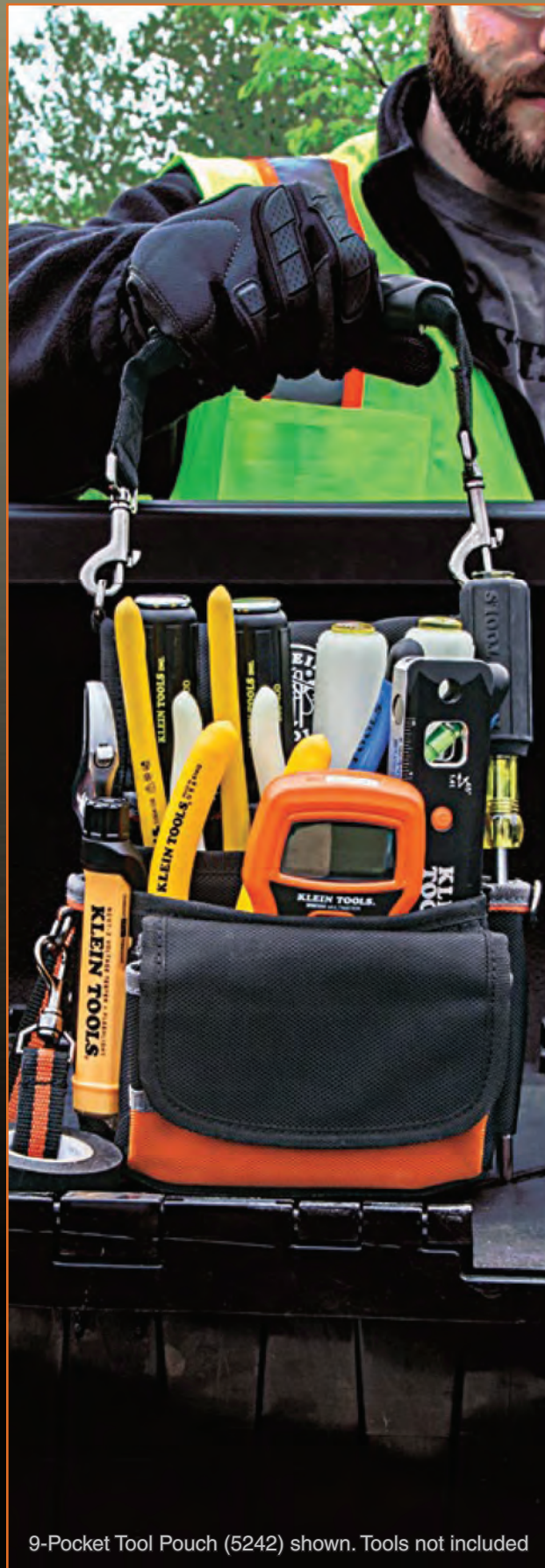
9-Pocket Tool Pouch (5242) shown. Tools not included